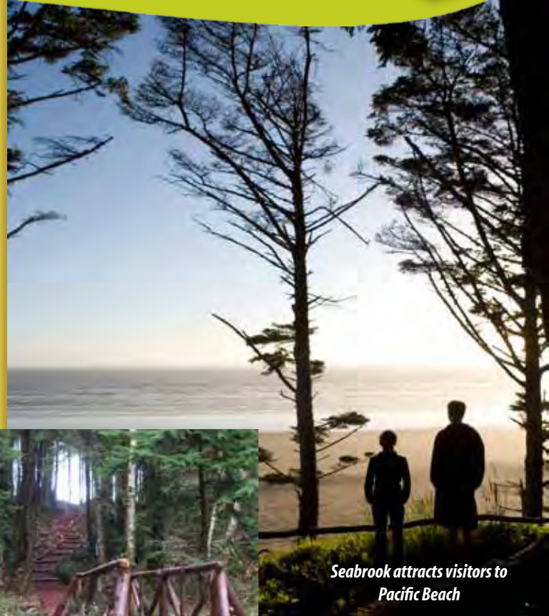
Seabrook attracts visitors to Pacific Beach